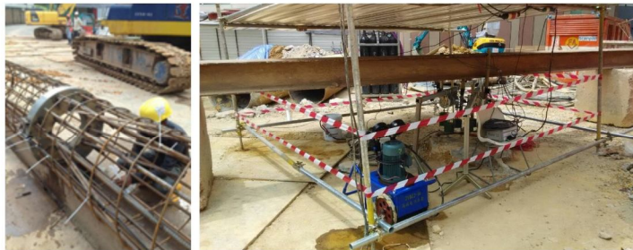
Catholic High School, Singapore (800mm OD, 6.12MN load, 1000mm OD, 5.72MN load, Year 2014)

Unlike conventional cells that virtually are combination of hydraulic cylinders, Super-cells consist of one or multiple inflatable jacks (Super-jacks) that produce large load. The patented Super-jacks adopt special sealing technology, and are made with large loading area, low original height, light weight, and excellent loading performance. Due to the large loading area, no high pressure is needed to produce high load. Usually, the max hydraulic pressure to do bi-directional loading test with super-cells is lower than 30Mpa. This dramatically reduces the risk of hydraulic failure. The Super-cells may be built in various shapes, depending on pile diameters and test purposes.