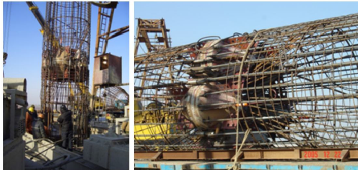
Hangzhou Bay Bridge (Longest Cross-sea Bridge ever built, 70MN load, Year 2006)

Super-cells were developed and introduced into market in the year 2005, and have been well proven in thousands of projects all over the world, with hundreds added every year.