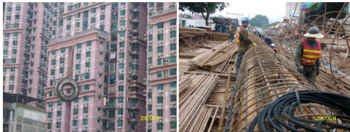
Qingzhoufang Residential Building, Macau, China (1000mm OD, 11.7MN load, Year 2012)